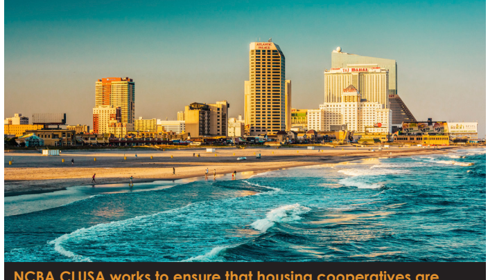
NCBA CLUSA works to ensure that housing cooperatives are eligible for emergency disaster assistance from FEMA in New Jersey.

In the wake of Hurricane Sandy, New York and New Jersey were the focus of NCBA CLUSA's advocacy efforts to extend FEMA emergency disaster assistance to housing cooperatives. H.R. 2887, sponsored by Rep. Steve Israel (D-NY) and S.1480, sponsored by Sen. Chuck Schumer (D-NY), would reclassify housing co-ops as eligible entities rather than businesses.