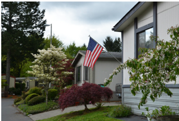
In 2012, Clackamas River Community Cooperative purchased the land beneath their homes and took control of their community—and their future.