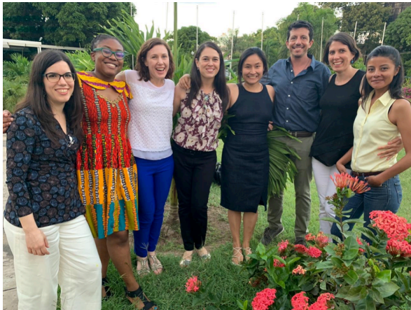
NCBA CLUSA's Farmer-to-Farmer team at the partners workshop in Jamaica.