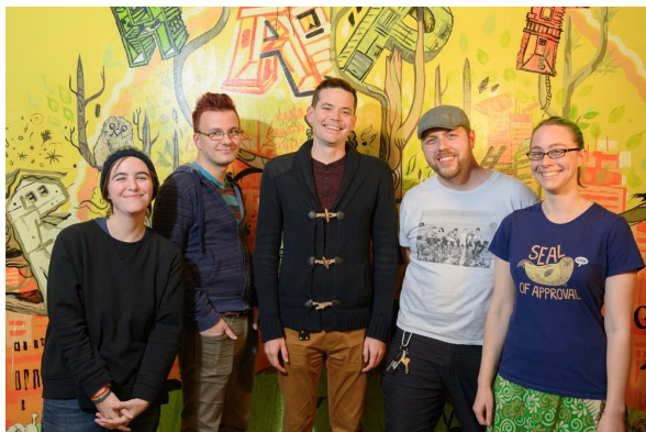
Founding members of the Happy Earth Cleaning Co-op.