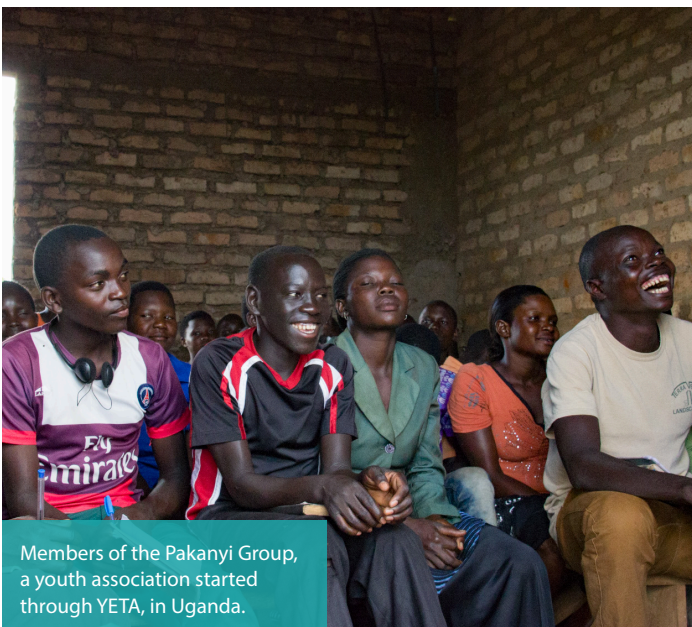
Members of the Pakanyi Group, a youth association started through YETA, in Uganda.

YETA deepens the skillset of Ugandan youth, integrating sexual reproductive health, numeracy, literacy, and life skills with technical expertise in agriculture, business, entrepreneurship, and management.