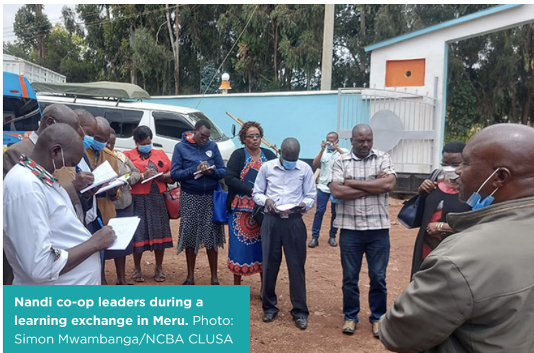
Nandi co-op leaders during a learning exchange in Meru.

CDP/CESI focuses on the ecosystem level, working to strengthen five secondary, or union, co-ops in Meru and Nandi counties, and 11 primary dairy and coffee co-ops that are members of