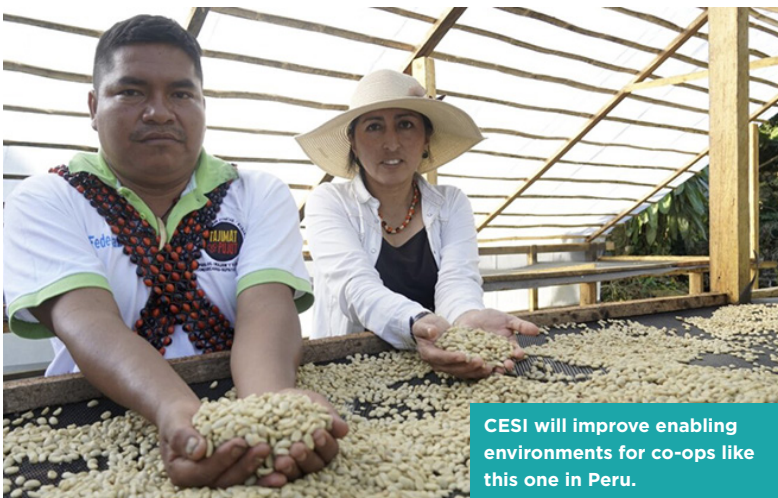
CESI will improve enabling environments for co-ops like this one in Peru.

Awarded through the U.S. Agency for International Development (USAID)'s Cooperative Development Program (CDP), NCBA CLUSA's Cooperative Ecosystem and Social Inclusion (CESI) project works in Kenya, Guatemala and Peru (through 2028); and Madagascar (through 2025) to further strengthen: 1) co-op capacity; 2) cooperative enabling environments; and 3) project learnings applied in the development community. CDP/CESI is informed by the success of NCBA CLUSA's CDP-funded Creating an Environment for Cooperative Expansion (CECE) project (2018-2023). This profile outlines CESI's global activities. For country-specific activities, partners and expected results, please refer to the corresponding country-level profiles.