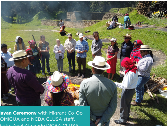
Mayan Ceremony with Migrant Co-Op COMIGUA and NCBA CLUSA staff.

CDP/CESI focuses on the ecosystem level, working to strengthen 10 Co-Ops and 2 Co-Ops Networks in Western Highlands and North Regions of Guatemala, focused on women, youth,