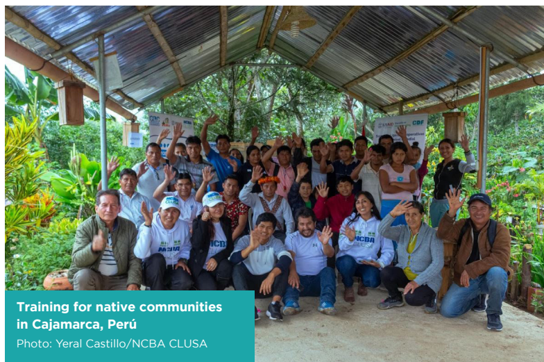
Training for native communities in Cajamarca, Perú

CDP/CESI capacity development activities focus on coaching with the 11 primary and secondary farmer cooperatives across the regions of Lima, San Martín, Amazonas, Cajamarca, Cusco, Junín, Lima, and Ucayali. These entities include six coffee and