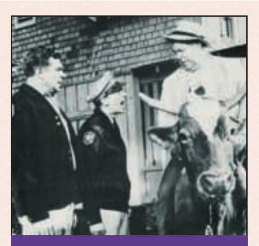
Don Knotts and Andy Griffith confront town drunk Otis Campbell. The co-op's winery is located in Mt. Airy, the boyhood home of Griffith and the inspiration for the fictional town of Mayberry.

Located in a three-story, 26,000-square-foot mercantile building constructed in the 1890s, the winery has a "vintage" (no pun intended) look, with oak floors and decorative tin ceilings. The winery is complete with a tasting room, gift shop and restaurant. The building is owned by the Old North State Winegrowers Foundation, a nonprofit organization that leases the facility to the cooperative.