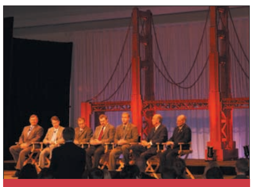
With a reduced-scale Golden Gate Bridge as a backdrop, NMPF staff fielded questions ranging from the workings of the CWT program to the outlook for the 2007 Farm Bill.

But innovation is not cheap, Gentine stressed. He described a process that involves consumer surveys, concept development and testing, product development and further testing, building or adapting plants and equipment and costly product launches (including advertising, promotion and slot-