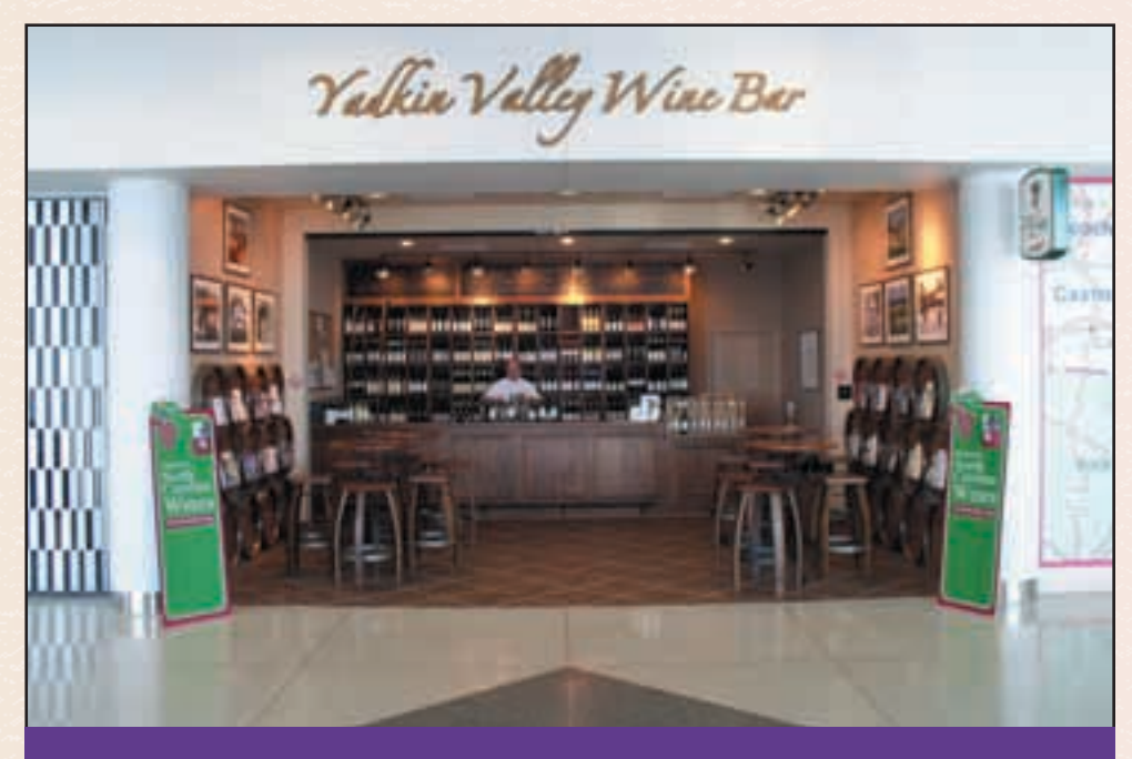
The association's wine bar opened at Charlotte-Douglas International Airport with the help of a VAPG from USDA Rural Development.

The Yadkin Valley Wine Bar has enjoyed remarkable success since opening in March of 2005. Visitors from other states and abroad can taste and purchase Yadkin