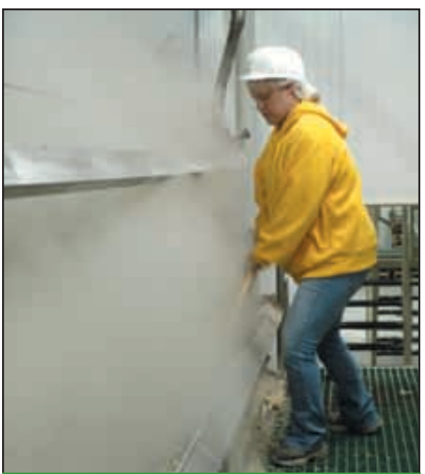
Potatoes are steamed during the dehydration process at the new Keystone Potato plant near Hegins, Pa., which uses power from methane gas piped in from a nearby landfill. USDA photo by Dan Campbell; Facing page: photo courtesy U.S. Potato Board

Buyers in the East typically have to pay about 12 cents per pound more for fresh potatoes than do their counterparts in the West, he notes. To offset that differential, a cheap source of energy was needed for a processing plant. Attention was first focused on one of