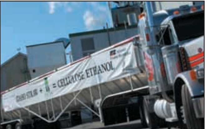
Idaho wheat and barley straw may someday be processed into ethanol, aided by a VAPG from USDA Rural Development. For more on this project, see page 30.

We believe these changes will significantly improve the application process and allow for the awarding of more grants. As always, our state and national office staffs are available to answer any questions. Happy New Year, and best wishes for a healthy and successful 2006.