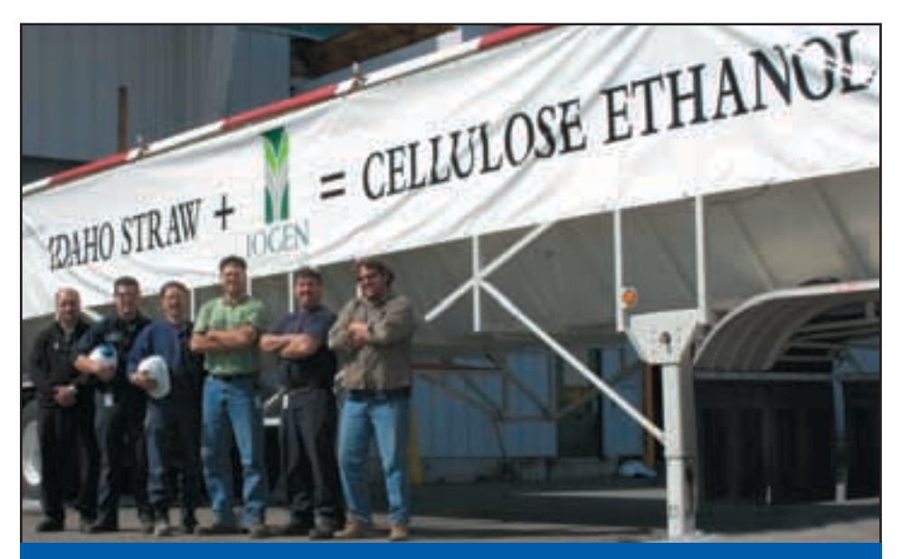
The Idaho Straw Value-Added Committee is pursuing the formation of a producer-owned co-op or LLC to supply a proposed ethanol plant that would produce fuel from straw. Here, growers celebrate a milestone in the effort, when they hauled two truckloads of Idaho straw to Ottawa, Canada, where it was processed into ethanol.

characterized and quantified aspects of feedstock production. Southern Idaho farmers worked with INL and others to understand and resolve issues related to harvesting, storing and pre-processing the feedstock; to protecting the integrity of the straw while in temporary storage; and to clarify methods to transport biofeedstock in compliance with a refinery's product specifications.