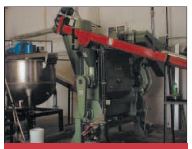
A small, relatively inexpensive crushing press and grease kettle can be set up on farms to produce bio-based greases for use at the site or for sale.

Production of industrial lubricants is a field that may offer attractive opportunities to co-ops. A research program of the University of Northern Iowa, called Agriculture-Based