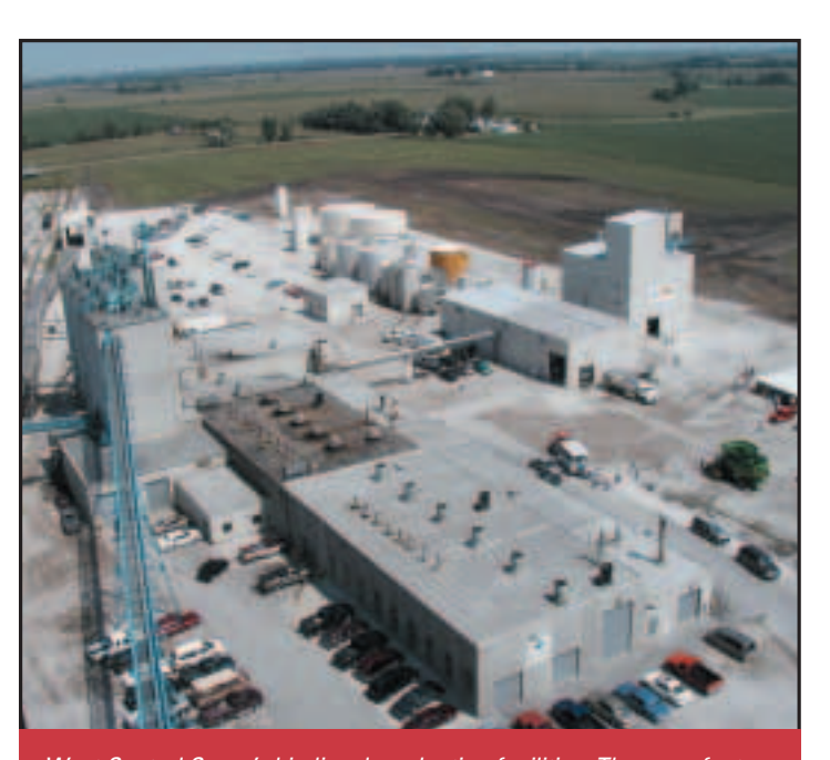
West Central Co-op's biodiesel production facilities. The manufacture of most bio-based products relies on relatively accessible technology.

Despite the new federal bio-based procurement requirements, high prices at present serve as a disincentive to soybean producers from making the investment needed to add value to their crops. But among the advantages of selling value-added and finished products is the vital one of more stable mar-