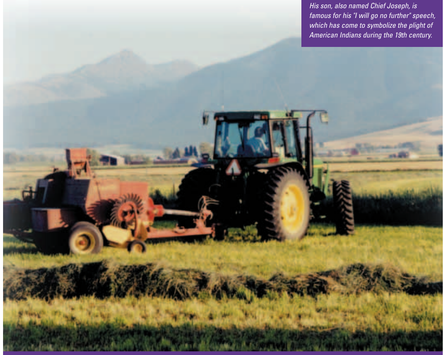
Hay harvested in northeastern Oregon may be sold locally, or could wind up being compressed, shrink-wrapped, loaded into 40-foot containers and shipped to customers around the Pacific Rim.