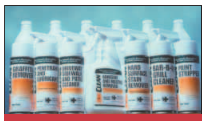
West Central Co-op-marketed soy-based cleaning products are promoted as less toxic and less harmful to the environment than are conventional cleaners.

Recent research has investigated the extraction of nutritional supple-