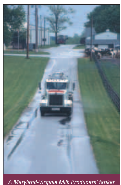
A Maryland-Virginia Milk Producers' tanker rolls through the farm country of Maryland. The co-op is one of 196 dairy co-ops in the nation, down from 226 in 1997.

in 2002, compared to 61 percent in 1997. The other 38 percent was manufactured at plants owned and operated by cooperatives. The number of cooperatives selling raw milk fell from 204 to 174 during this period.