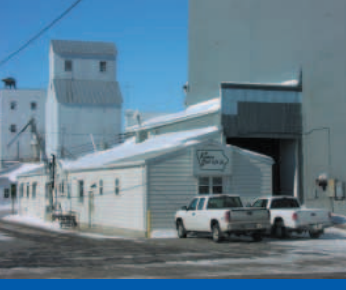
Farmers Co-op Elevator Co. in Ruthven, Iowa, has created a new subsidiary to process soybeans into meal and oil.

Soy methyl ester is commonly known as biodiesel, an alternative fuel that can be used as a blend in petroleum diesel. Its physical and chemical properties (as it relates to operation of diesel engines) are similar to petroleum-based diesel fuel. More than 10 years of testing and 60 million road miles have proven that biodiesel is comparable to conventional diesel in performance, fuel efficiency, power and torque.