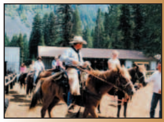
From top: Hay bales are loaded onto flatbed trucks or stored under tarps, then trucked to destinations, such as a livery stable from where trail rides begin into the scenic mountains of northeastern Oregon. Opposite page: a sign at the Wallowa County hay station urges a concerted effort to help prevent the spread of noxious weeds.