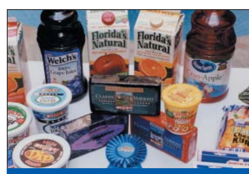
Some of the many cooperative-owned food brands on display during the Cooperative Marketing Act 75th anniversary celebration.

Shortly after AFBF was formed in 1919, it established a cooperative marketing department and later assisted in creating the national enabling legislation (CMA), Newpher said. AFBF, now representing 5 million member families, saw the need for "a strong organization