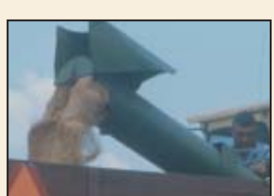
Corn, soybeans and other feedstocks are being used to fuel new bioenergy plants.

■ Maryland grain growers are exploring a barleybased ethanol facility. The state has a corn deficit because so much of it is consumed by its giant poultry industry. The plant would produce between 15 million and 25 million gallons of ethanol a year and cost