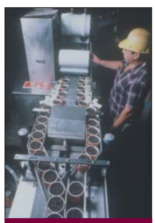
Sun Maid, a grower-owned cooperative, is the industry's largest processor.

"We need to get to a level where we can start selling raisins and get our markets back," says Rebensdorf. "The only way we're going to do that is to reduce production. Our problem is over-supply."