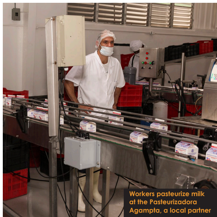
Workers pasteurize milk at the Pasteurizadora Agampita, a local partner